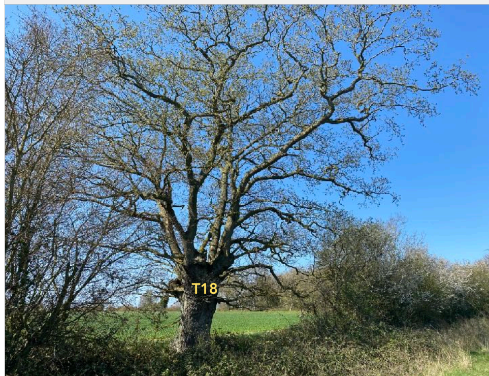
IMAGE 4: T18, English oak tree of lapsed pollard form, Category A3